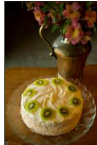
After a brilliant day on the river, enjoy River Haven's exquisite cuisine. Don't miss out on the home-made bread with honey from Bees & Trees! What a way to start the day....