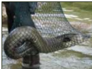
Looking for a "different kettle of fish"? How about landing a meter long eel!